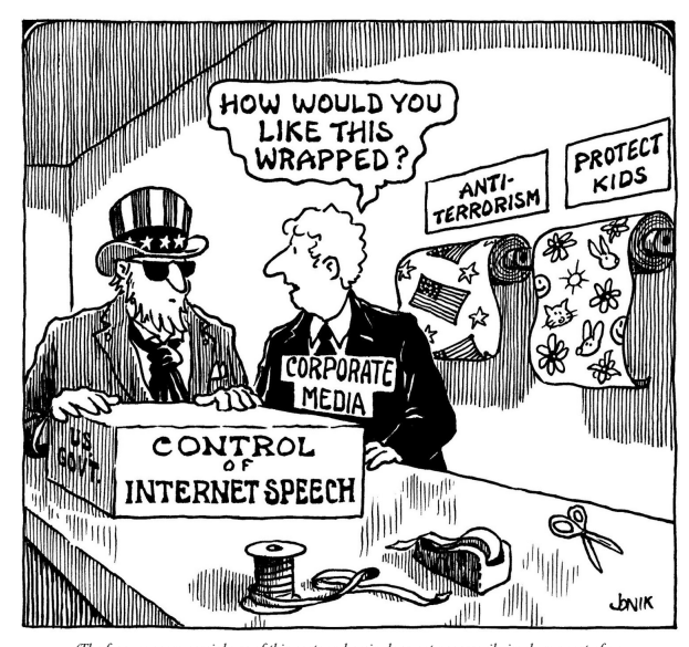
(The free, noncommercial use of this cartoon herein does not necessarily imply support of or opposition by the artist for views presented in this booklet.)

https://www.telegraph.co.uk/news/earth/wildlife/8122026/Whales-sunburned-by-thinning-ozone.html